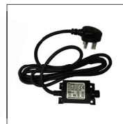
IP65 Power supply