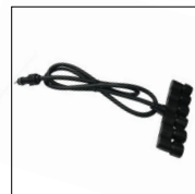
IP65 Junction unit

MULTI is a robust and versatile 6 light LED kit incorporating unique GAP design and high powered SMD technology. SS316 marine grade stainless steel ideal for marine lighting and exterior in-ground installations.