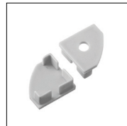
Plastic end caps

45° aluminium channel ideal for corner applications. Includes pc diffuser for anti-glare light output. Create a continuous linear LED lighting system. Suitable for diverse interior application.