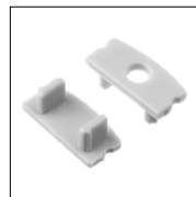
Plastic end caps

Surface mount aluminium channel for various LED striplights. Includes PC diffuser for anti-glare light output.